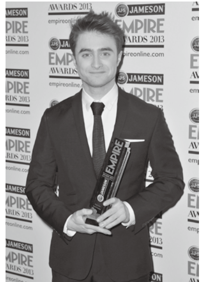
Daniel Radcliffe in London in 2013 at an awards ceremony

The world now waits to see what Radcliffe does next. He has already appeared in stage plays and other movies. He has also become deeply involved in charity work. In particular, Radcliffe supports the Trevor Project, which gives support to young people who are in crisis. Speaking about such young people, Radcliffe said, “I believe that reaching out for help is the bravest thing a person can do”.